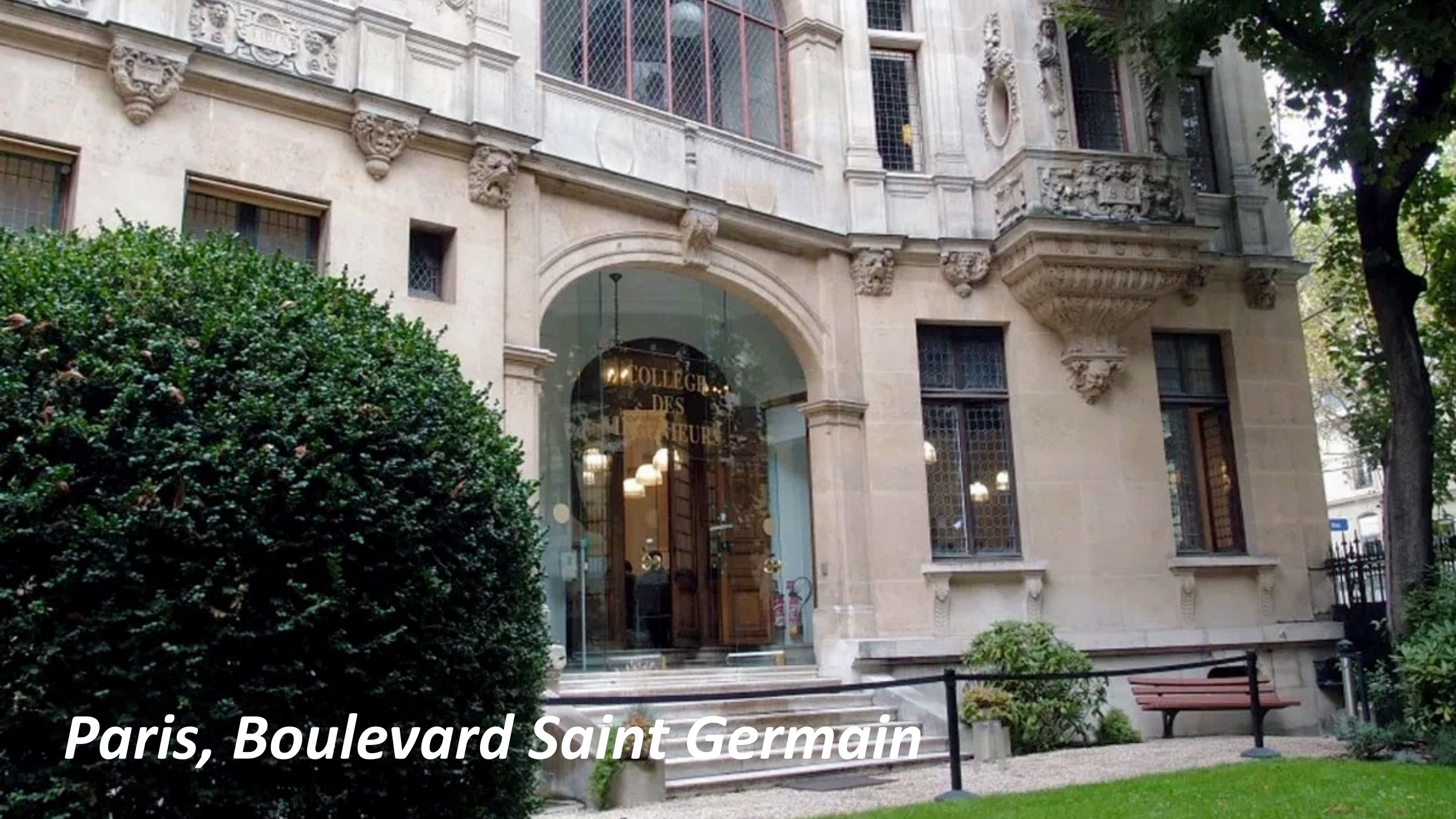
Paris, Boulevard Saint Germain